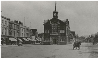
Thame through the years